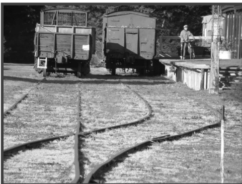
Domino Trail, Trentham Station

And for something different, try the Daylesford Permanent Orienteering course on foot or mtb. Maps at visitor centre or download from tinyurl.com/euopoc